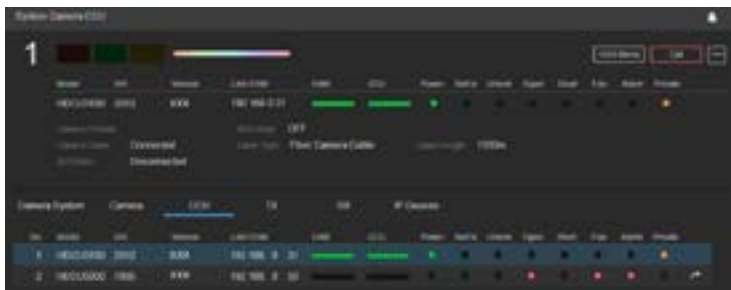
Sample of CCU Web UI The GUI design will change for POV.

* Please ask lens manufacturers for supported lens information.